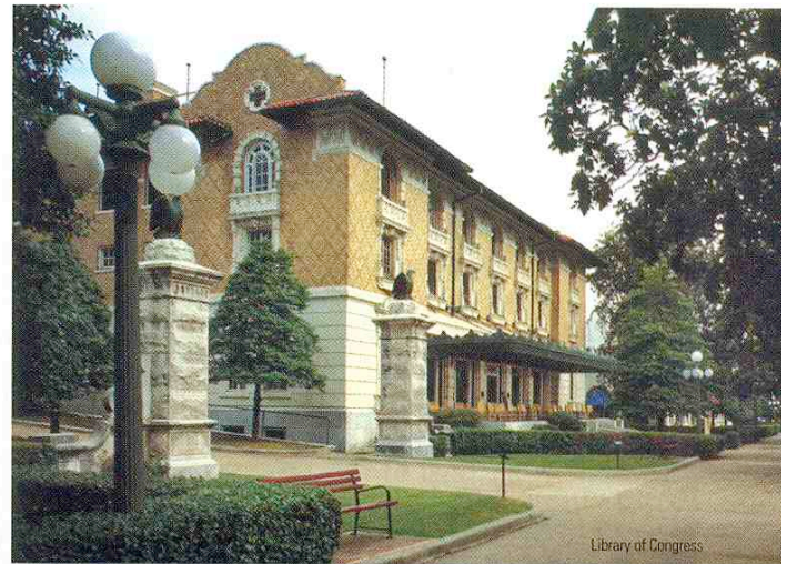
The Fordyce Bathhouse was built in the Spanish Renaissance style in 1915 by the wealthy and affluent Fordyce family.

days when "taking the waters" was a fashionable pastime. Strange and even amusing equipment, some looking as if they were designed for torture rather than healing, are seen in the different rooms. All kinds of pulleys, gauges, levers, and nozzles occupy the electro- and mechano-therapy chambers. Steam cabinets remind you of those seen in cartoons where people go in grossly overweight and come out