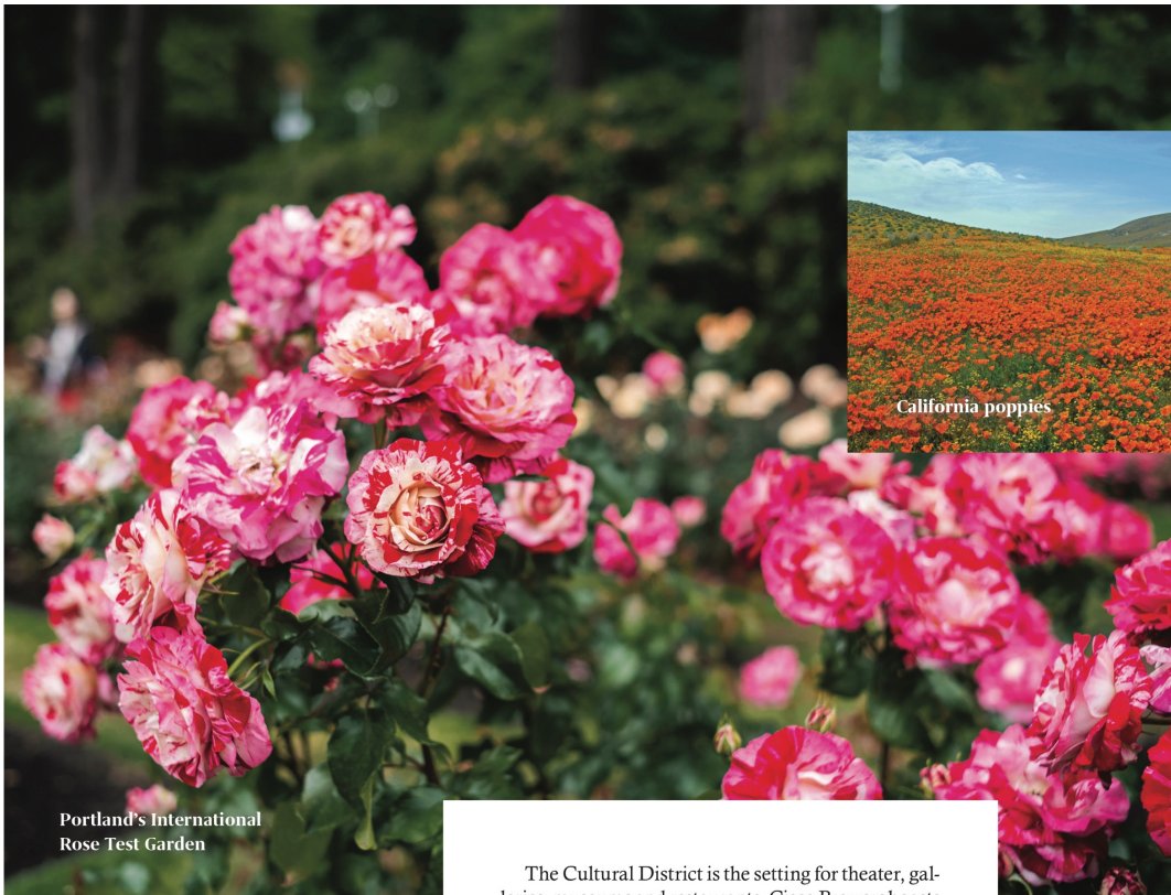
Portland's International Rose Test Garden